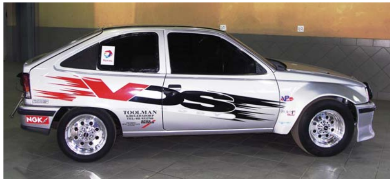
Superboss is rated the fastest front wheel drive vehicle in Africa.

with imported units. Pauter conrods and Wispeco pistons have been substituted and a Turbonetics T66 turbo fitted. The T66 blasts out a powerful 2.7 bar through the piping, huge MRP cooler and inlet manifold before it gets mixed with a specially formulated fuel mix. That's just to ensure that extra dash of vooom when Wynand is drag racing at Tarlton or Wesbank Raceway.